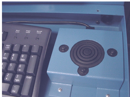
Unit shown mounted in a keyboard tray

Responding to strong interest from its industrial automation and marine equipment OEM customers, ITAC has introduced Sealed versions of its PS/2, Sun, and USB versions of its Dome Technology input devices in panel mountable configurations. ITAC's Dome Panel Mount MOUSE-TRAK products offer more ruggedness than industrial trackballs and better precision and control than sealed touchpads. These new devices use a deformable dome mounted over a miniaturized motion encoder mechanism to capture user inputs.